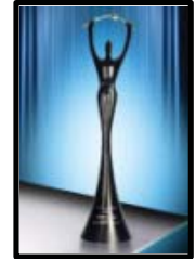
Electra Award 2005